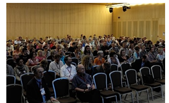
Sharing information & connecting Bringing people together to make sense of psychosis (extreme states)

Support us to continue promoting psychological and social approaches to psychosis - see our website for more information at- www.isps.org.au